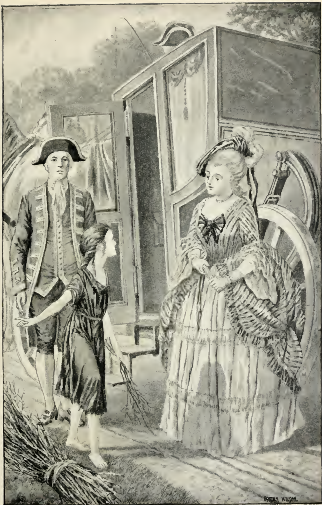
Little Jeanne de Valois