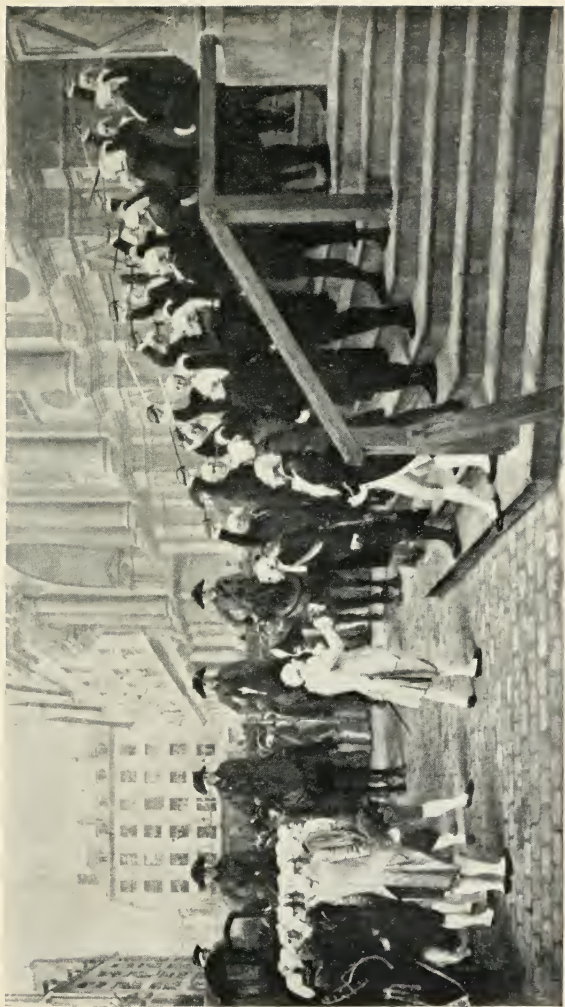
The Arch of Steel J. P. Laurens