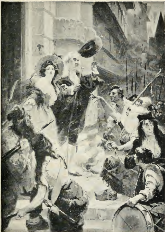
Aristocrats, 1790 Fred Roe, R.I.