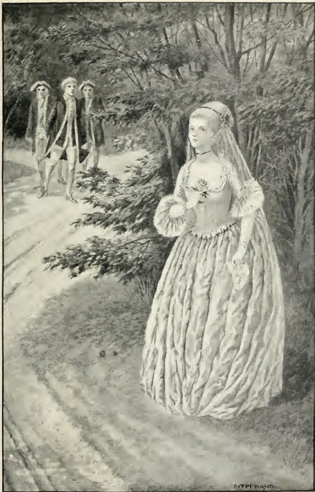
In the shadow of a hornbeam hedge