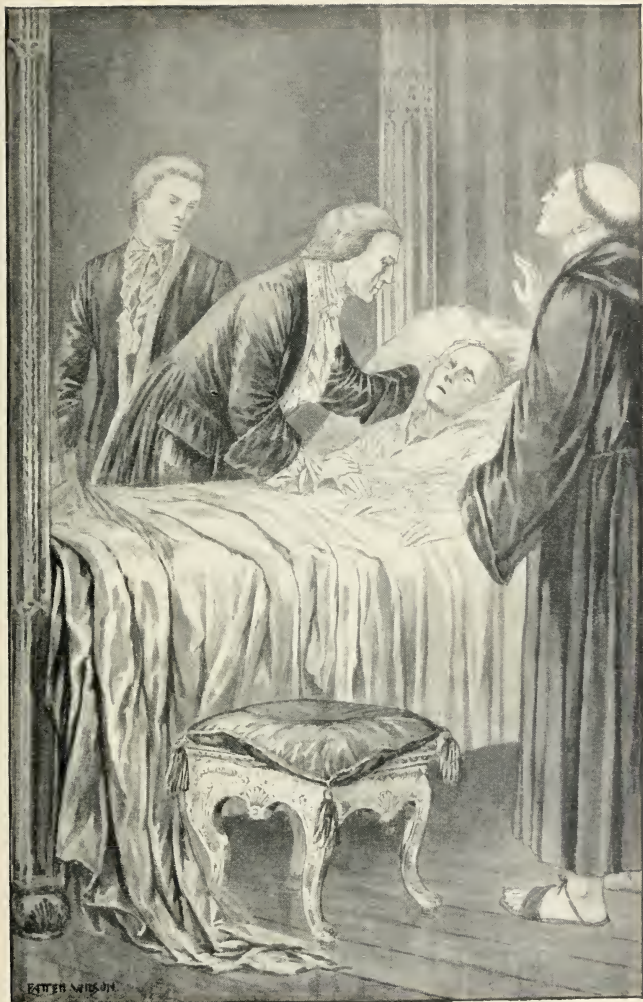
The death of Louis XV